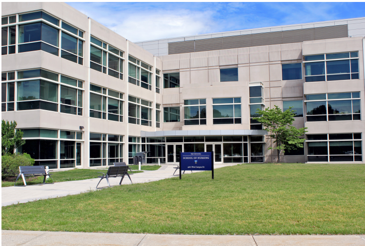
Yale School of Nursing

An interdisciplinary health sciences approach to addressing social justice & health equity