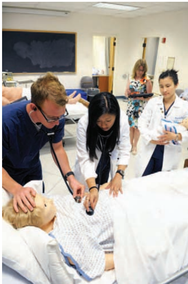
Students get to know their new patients.