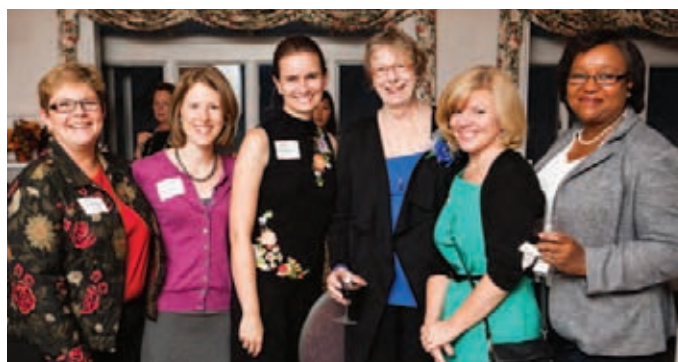
Reunion weekend is a great opportunity to celebrate friendships.