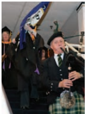
Bagpipes led the procession.