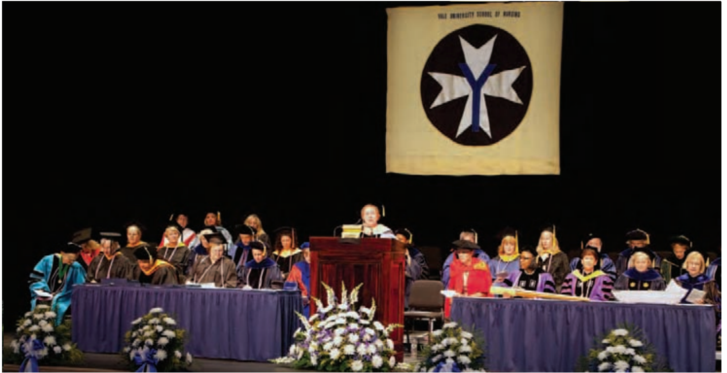
Family and friends gathered at the historic Shubert Theatre to congratulate the Class of 2011.

Yale University School of Nursing celebrated its 85th commencement on Monday, May 23, 2011, with 101 MSN, two Post Master's Certificates, and three PhD graduates.