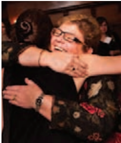
A familiar scene during Reunion weekend!