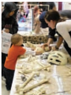
Safety issues such as bike helmets and lead paint are emphasized at the health fairs.

Yale Nurses have a century-long tradition of going into unknown territory to make change. They understand the importance of addressing not only the whole person, but sometimes the whole community, to create better health for all. Some Yale Nurses take on this responsibility from their first semester at YSN.