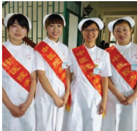
The Honor Guard welcomes us.