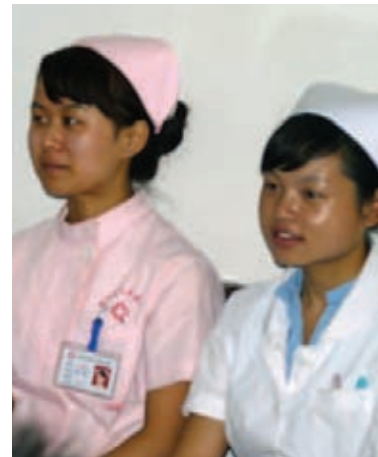
Nurses from Xiuning Hospital attend our lectures. The color of uniform denotes their specialty.