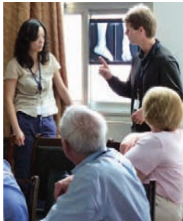
Orthopedic consultation with a Chinese patient.