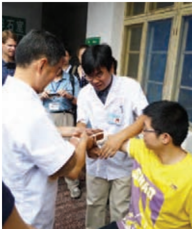
Traditional medicine demonstration. The type of wood used to splint was selected for its healing properties.