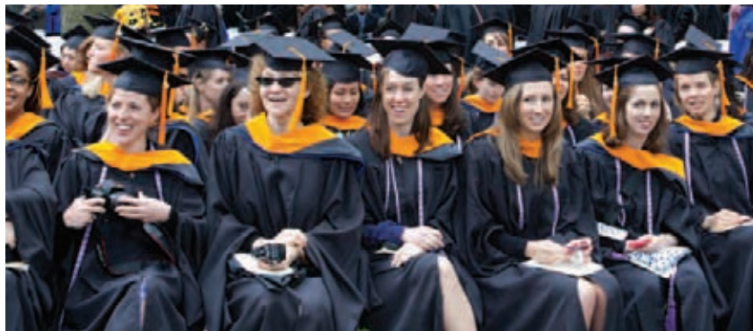
Graduates gathered on Yale's Old Campus.