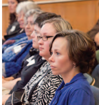
A captivated audience at Friday evening's panel discussion.